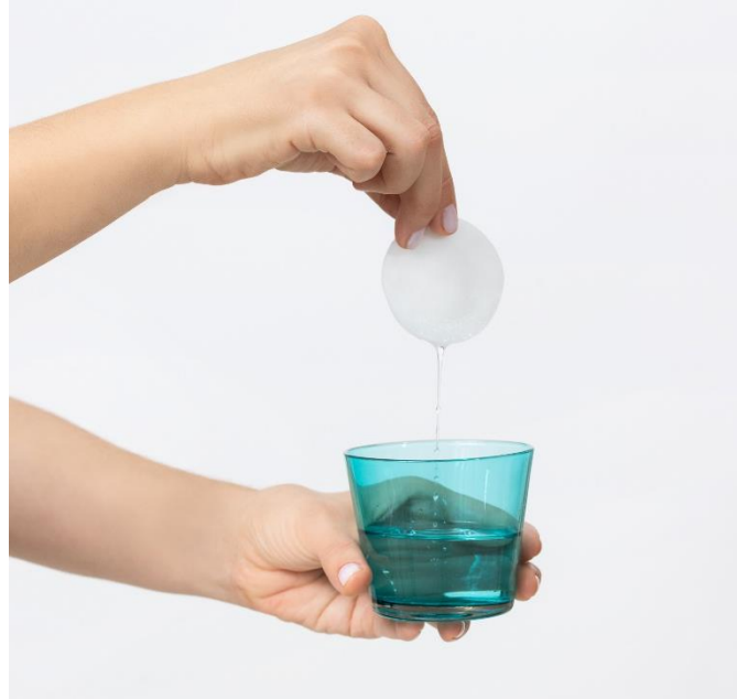
Clean the eyelashes thoroughly with an eye wash. Use a wet cotton pad.