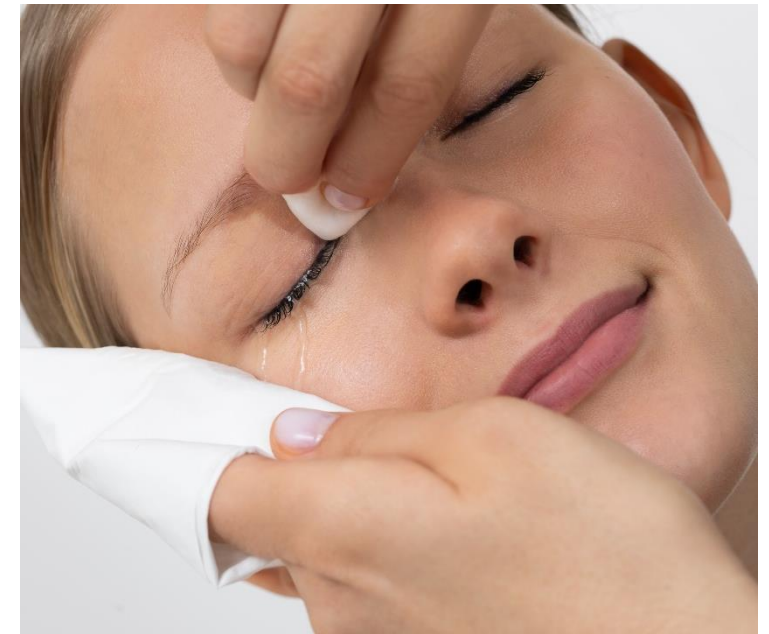
Press this out from the outer to the inner corner of the eye. The client's eyes should remain closed.

This type of rinsing removes colour residues particularly thoroughly.