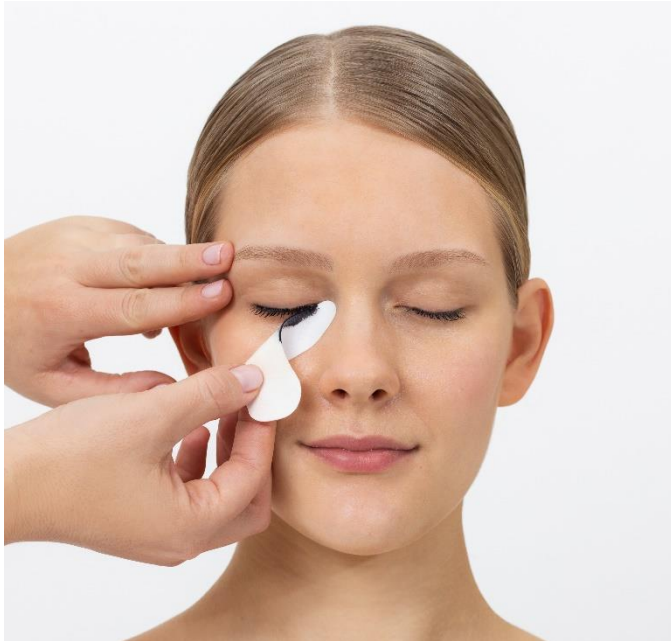
Remove the Eye Care Pads.